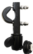
VT550 Clamp Mount