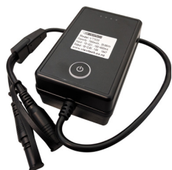
VT509 Camera Battery

The battery will run for around 6 hours of use. VT12V1A is a battery charger available for this pack.