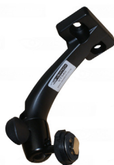
VT540 Overhead Mount