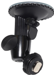
VT547 Suction Mount