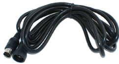
VT27P Monitor Loom Extension