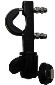
VT550 Clamp Mount