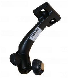
VT540 Overhead Mount