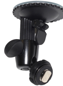
VT547 Suction Mount